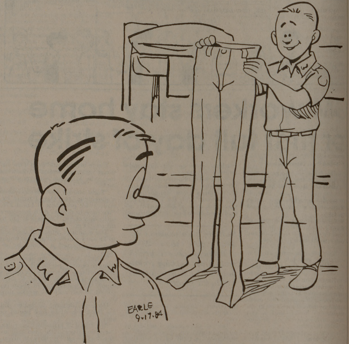
"There has been a mixup in my laundry, but if I can trace this guy's laundry mark, I'm giving the basketball coach a call."