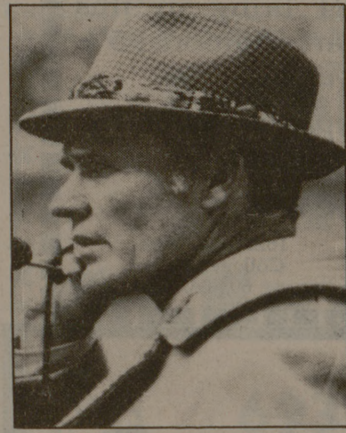
Dallas' Tom Landry

About 20 percent of the stadium is left unsold for the Dallas-Indianapolis game on Oct. 28.