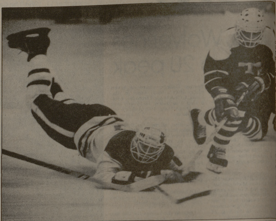
A Texas A&M Hockey team player breaks down the ice as an SMU player makes a sprawling attempt to take the puck away from him during action last season in Waco.