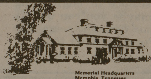
Memorial Headquarters Memphis, Tennessee

BIG EVENT: an organizational meeting will be held in 307 Rudder at 7 p.m.