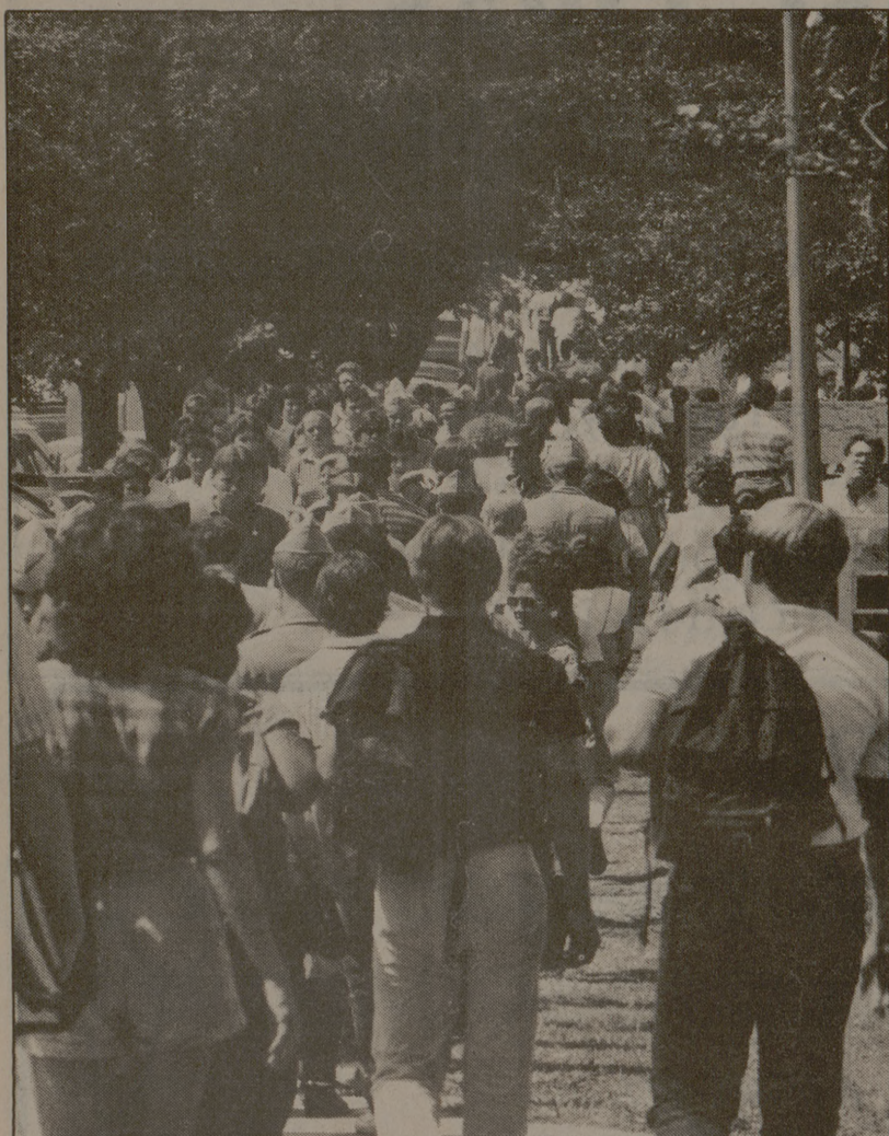
Tight squeeze

The time between classes is not for the faint of heart, as throngs of students make their way from the Blocker Building toward Reed McDonald into the heart of the Texas A&M campus.