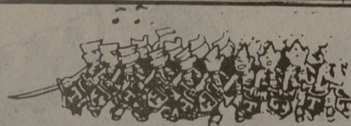
The band gets its news from the Batt.

Students should be aware of the fact that volleyball tickets will not be included in the all-sports season ticket books.