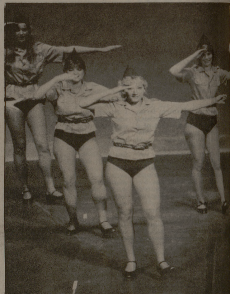
The Dance Arts Society — which is one of the newer student organizations at Texas A&M — is open to anyone who wishes to be a member.