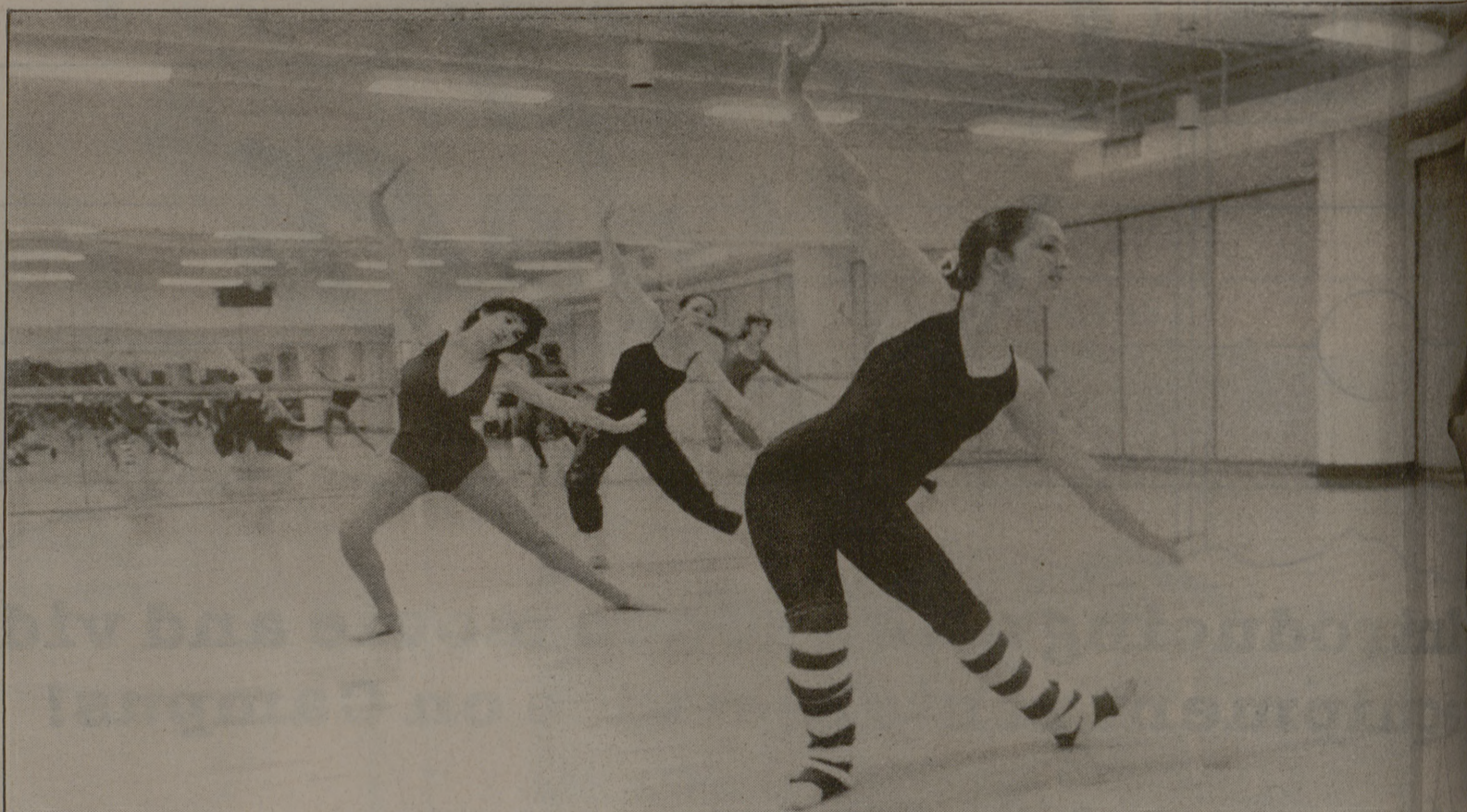
Members of the Dance Arts Society practice for one of its performances in Rudder Auditorium. The dancers use the studio in East Kyle for practice and to teach and attend dance classes.