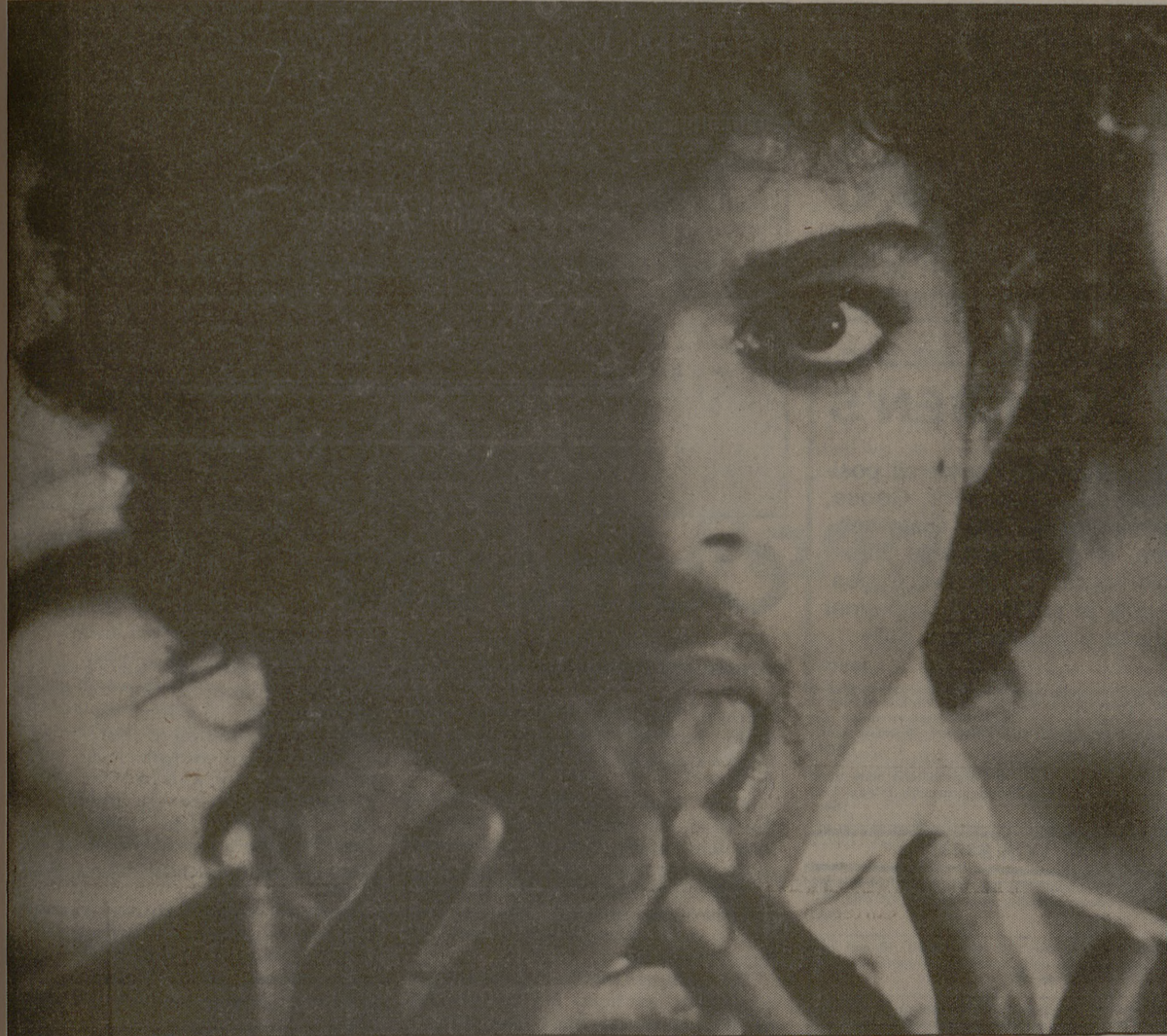
Prince in 'Purple Rain'

If you're already a Sammy Hagar fan you'll no doubt enjoy it. If you've never heard him before, at least give it a try. You just might have some fun.