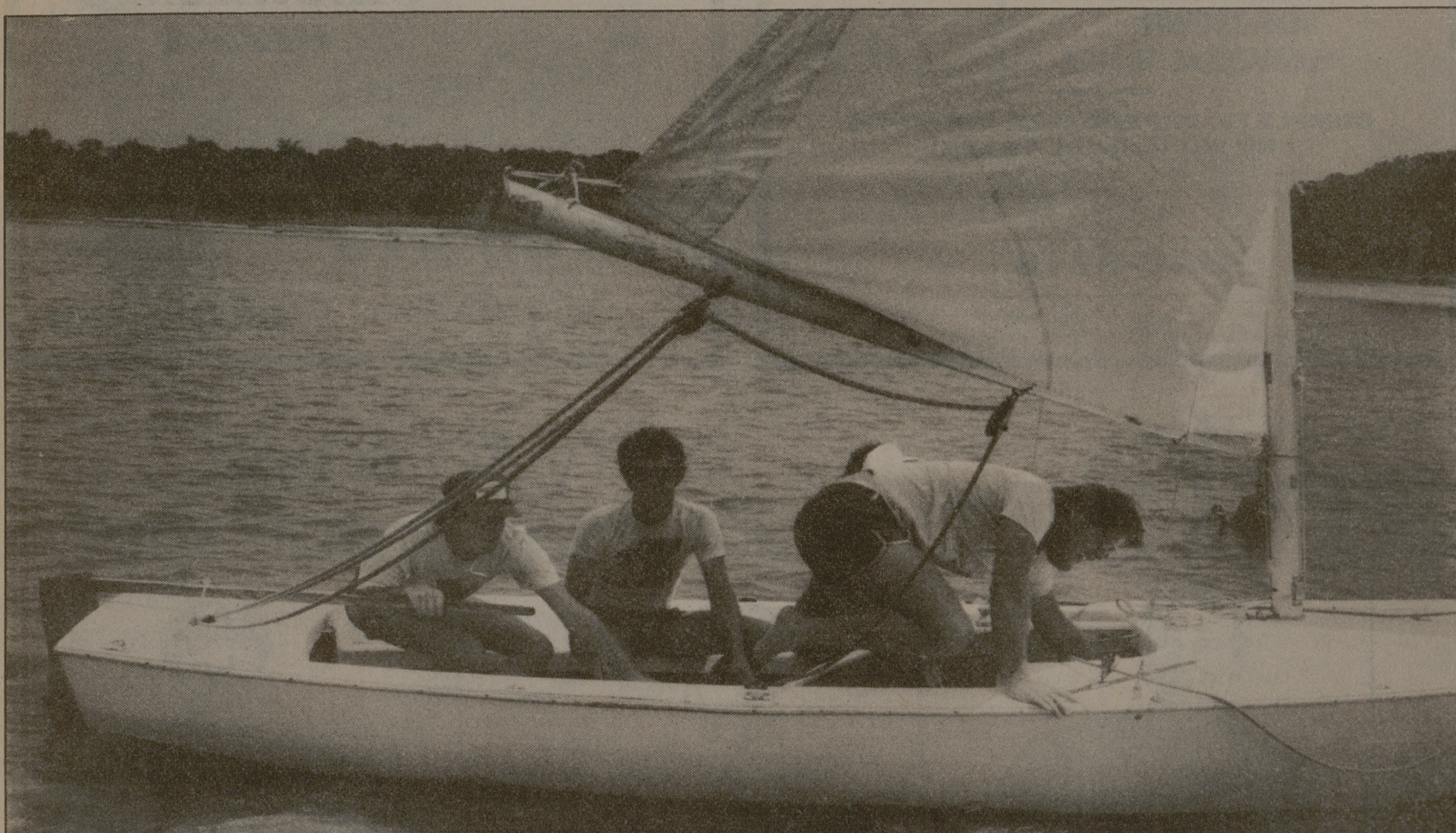
All ashore going ashore