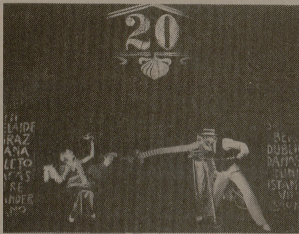
Photo Top: Klaus Tennstedt Photo Bottom: "A Week of Dreams" / The Black Light Theatre of Prague