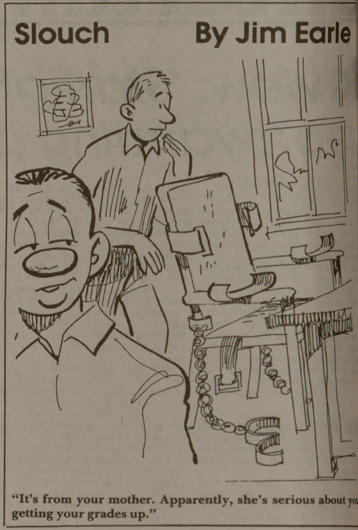
"It's from your mother. Apparently, she's serious about you getting your grades up."