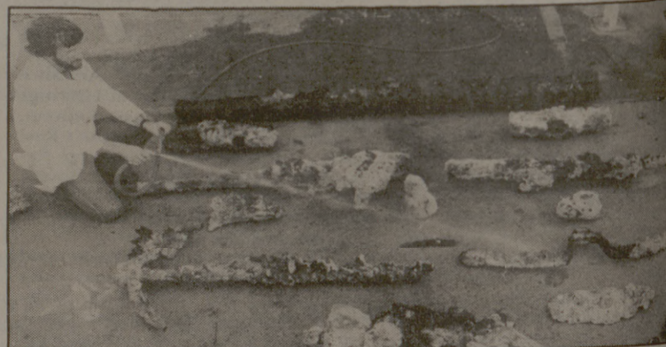
A worker cleans artifacts from the 16th-century Spanish ship which is being analyzed by the Institute of Nautical Archaeology at Texas A&M University.

cannons, 17 smaller swivel guns, crossbows and shoulder arms.