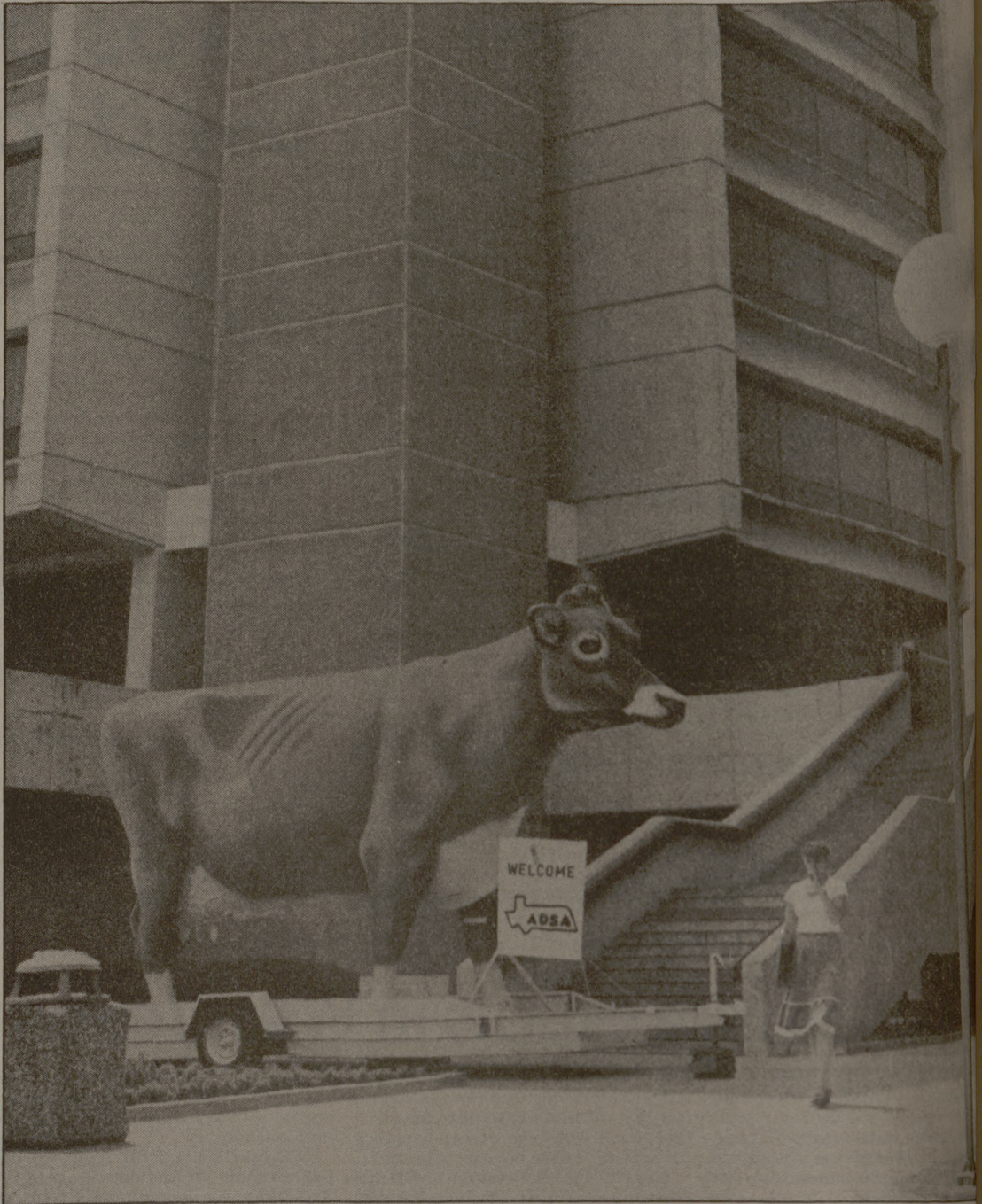
Daisy Moo Cow

Daisy Moo Cow stands watch in front of Rudder Tower as people walk by. The big cow statue greets members of the American Dairy Science Association Conference.