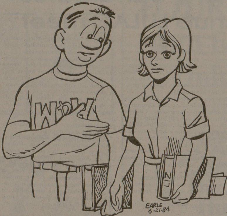
"Just remember that a lot of freshmen who have trouble with math grow up to become worthwhile people."