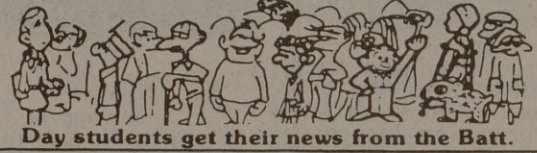
Day students get their news from the Batt.