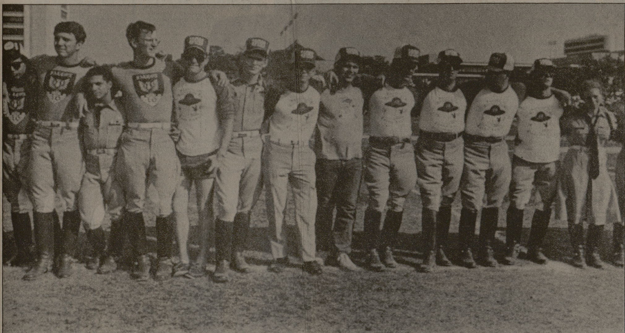
Saturday afternoon's second pass at Final Review saw several seniors solemnly reviewing their years here.