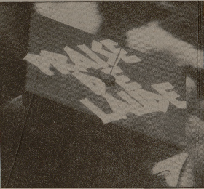
This graduate's hat expressed the sentiments of many graduates and their parents at last weekend's graduation exercises.

This weekend, about 3,300 Aggies said farewell to friends and became former students during commencement ceremonies held Friday and Saturday in G. Rollie White Coliseum. Friday afternoon, the graduates from the Colleges of Agriculture, Geosciences, and Liberal Arts heard San Antonio Mayor Henry Cisneros speak. That night Gov. Mark White spoke to graduates of the Colleges of Architecture and Environmental Design and Engineering. Saturday morning, graduates from the Colleges of Business Administration, Education, Science and Veterinary Medicine, and students from Texas A&M at Galveston listed to Vice President George Bush. Later that day, 153 cadets were commissioned into the U.S. Armed Forces by Gen. Paul X. Kelley.