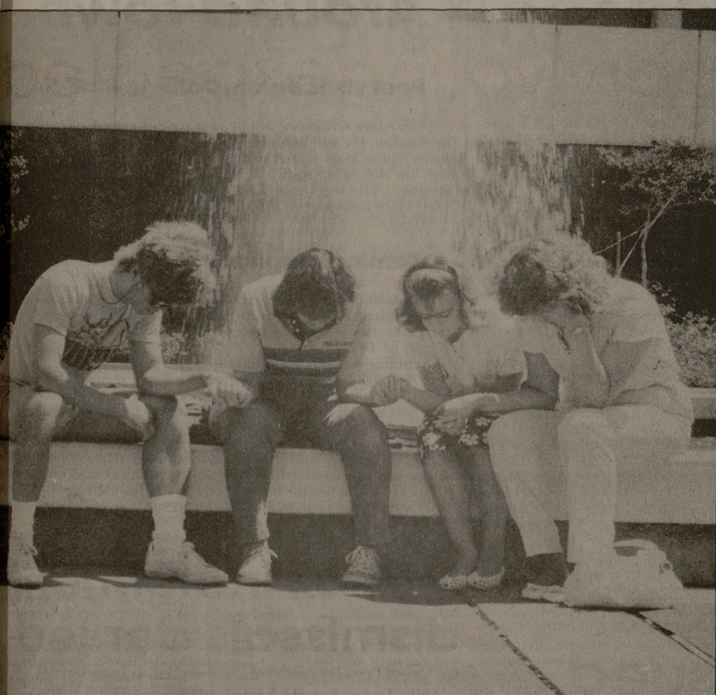
Group Prayer