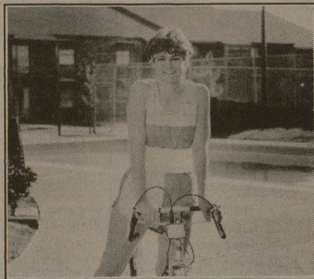
Cripple Creek Condominiums offer you style.

Located in the heart of student living, these new condominiums are close to restaurants, shopping, clubs, banking facilities and right on the shuttle bus route.