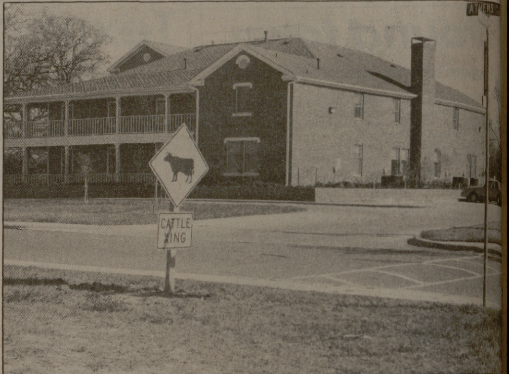
Moo-ving along