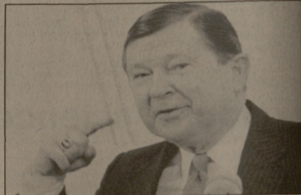
Sen. John Tower gives the "cut" signal at the end of a press conference held before the banquet given in his honor at the Brazos Center Sunday night.

"I don't agree with that," he said. "I don't want to see it cut. The defense budget shouldn't be sized according to appropriations, but to the requirement according to the threat to the security of the U.S."