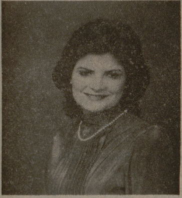
Deana Tunnel Bridal Boutique