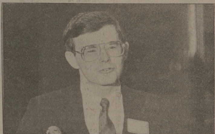
Congressional candidate Joe Barton