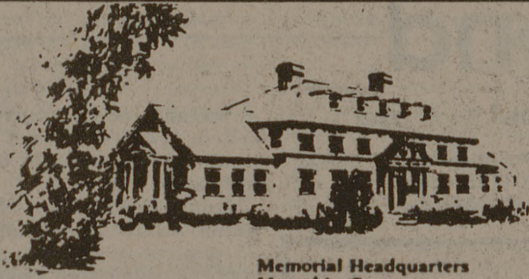
Memorial Headquarters Memphis, Tennessee