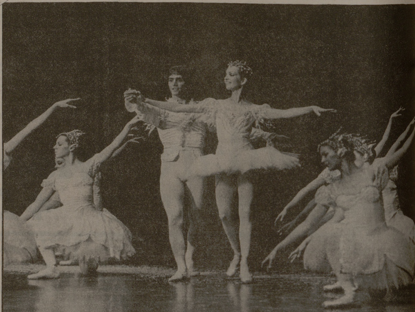
A Christmas Tradition