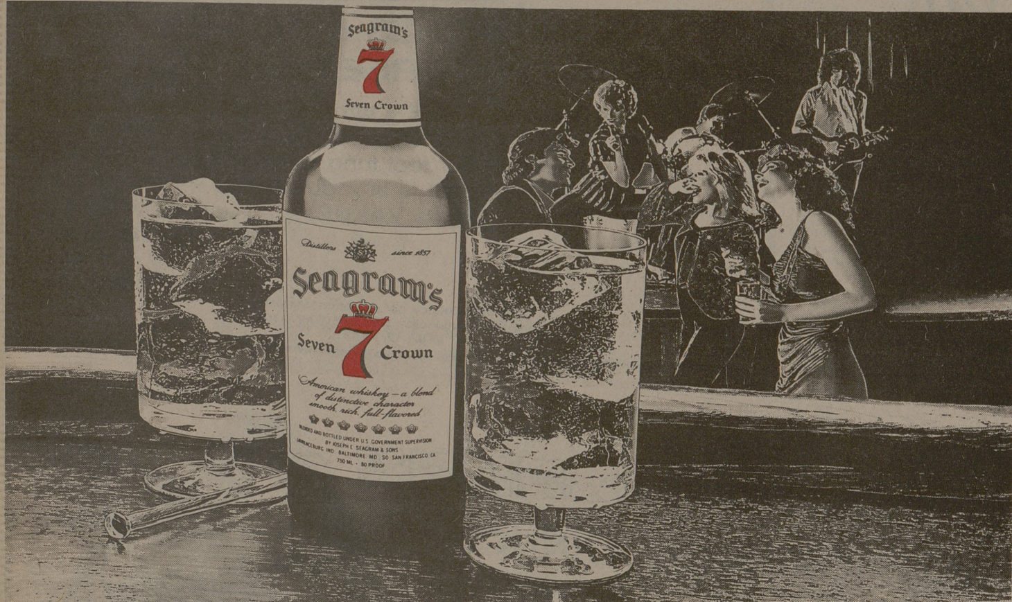
When the beat gets hot, dance fever stirs with the cool, refreshing taste of Seagram's 7 & 7UP. It also stirs with the light taste of Seagram's 7 & diet 7UP. Real chart toppers, and, enjoyed in moderation—the perfect partners for dance fever.

"We lost our leading rebounder and assist man, according to our fans, we're supposed to be weaker," Valvano said. "They want us to be just as good as we were last year."