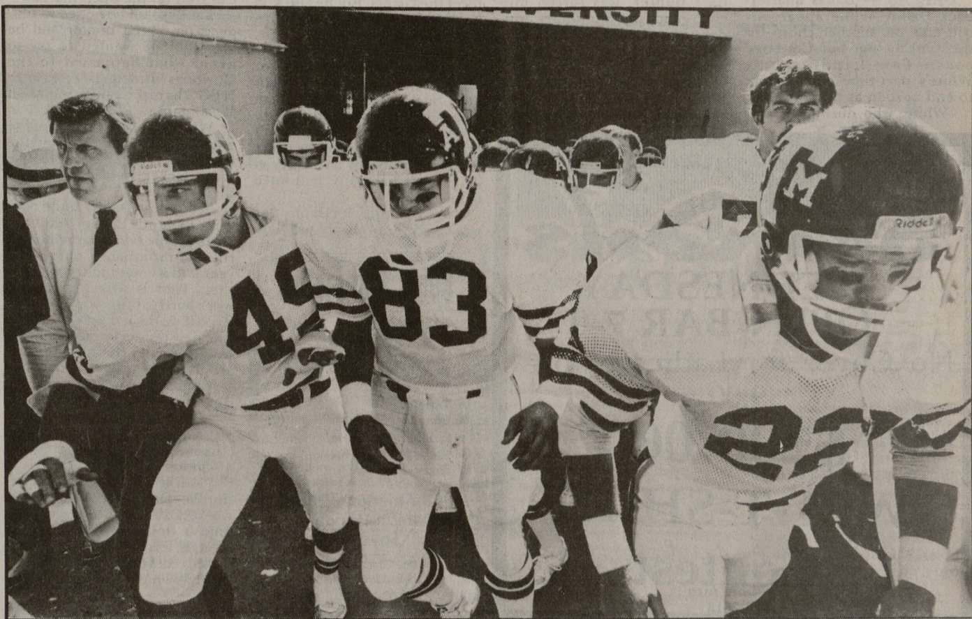
Taking the field