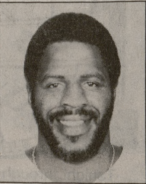
RB Earl Campbell scored Oilers' only touchdown

Stoudt's pass to Abercrombie ruined a great defensive effort by Houston. On a 2nd-and-10 from Pittsburgh's 49, the Oilers forced Stoudt out of the pocket, but he broke free of three defenders along the sideline and flipped a pass to Abercrom-