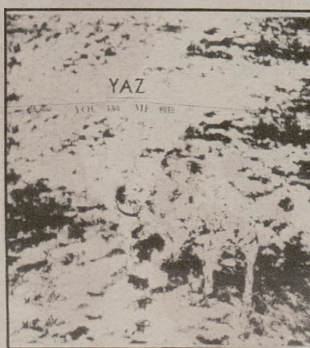
Yaz You and Me Both Sire

the Clock will not go down as one of his most outstanding projects, any lover of new music cannot go wrong with this selection.