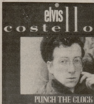
Elvis Costello Punch the Clock CBS

four stars and a half Elvis Costello has been the critic's "baby" for the past five years, with a string of albums that all have captured quite a bit of critical acclaim. It's really not Elvis' fault; he just happens to be one of the most creative and consistent artists to emerge in the last decade. Punch the Clock is another great addition to the Costello