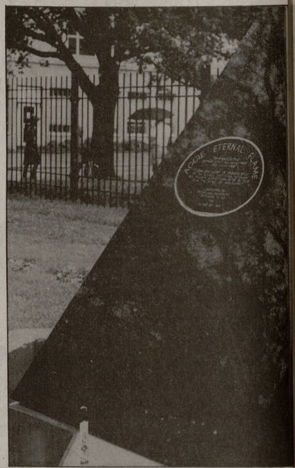
The Class of '83 plans to light the Aggie Eternal Flame at Yell Practice tonight.

Come Join a Friendly Fellowship of Christian Students