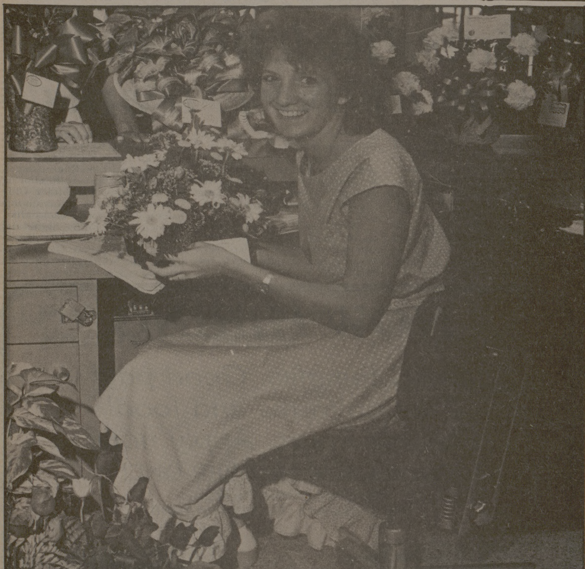
They are all mine !!!