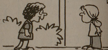
"Guess what! I just bought a time-sharing do over the telephone."