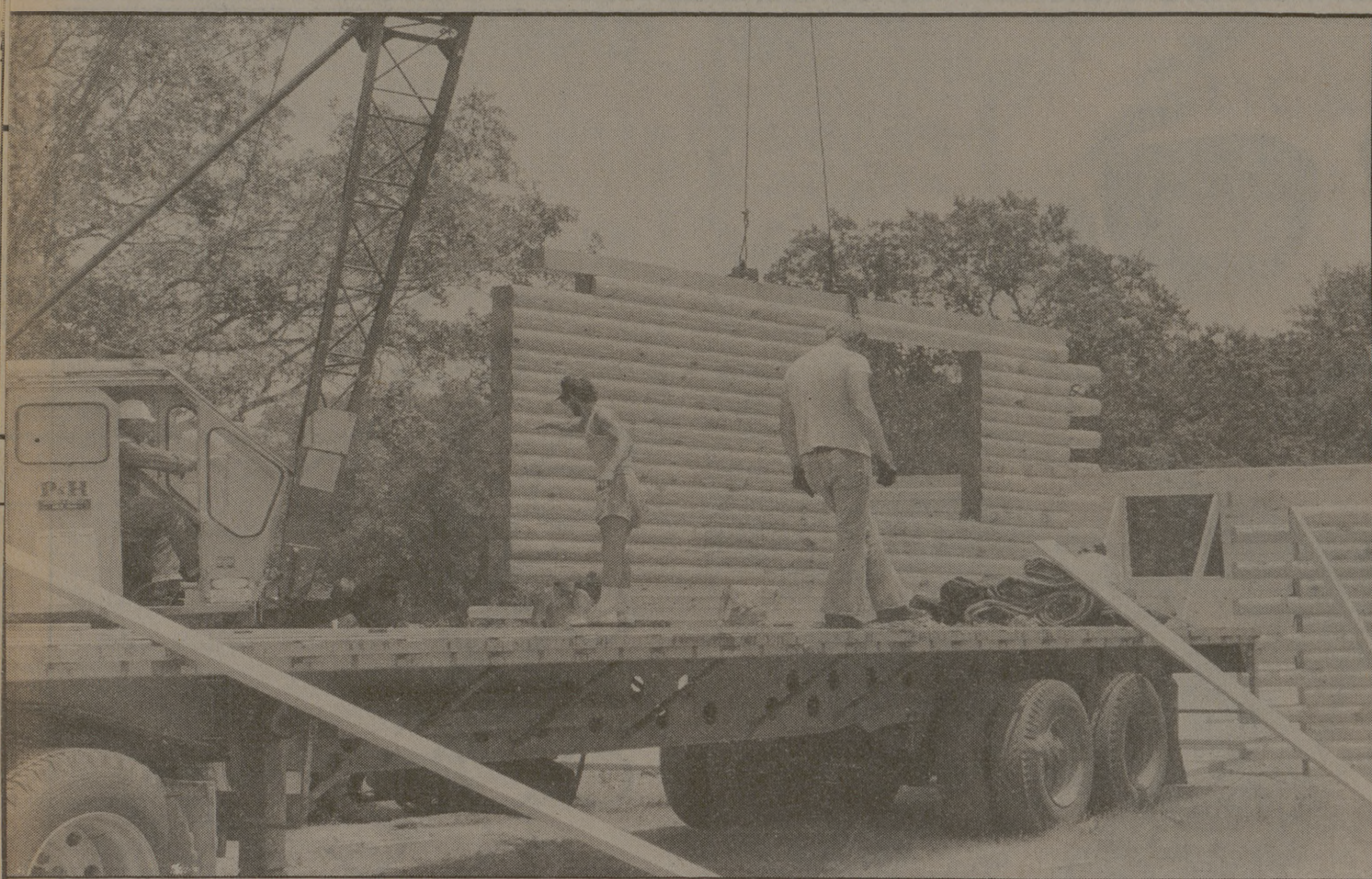
They don't build 'em like they used to!