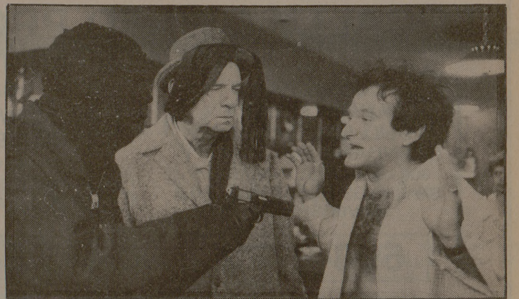
A masked gunman holds up Robin Williams, who plays an unemployed business executive in the comedy "The Survivors." Walter Matthau, center, plays an unemployed gas station manager.

Roy Scheider stars as a police helicopter pilot assigned to test an ultra-sophisticated surveillance and attack helicopter in this fast-paced adventure. The question is: will the good guys get the copter or will the bad guys get it? Also stars Candy Clark, Malcom McDowell and Warren Oates. Directed by John Badham. Rated R.