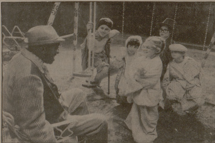
Scatman Crothers, left, takes delight in the fact that the residents of his nursing home have become children in a segment of "Twilight Zone: The Movie," which starts here Friday.

Anthony Perkins returns as Hitchcock's classic schizo, Norman Bates. Twenty-two years later he returns to Bates Motel. An unpretentious sequel that plays on our knowledge of the first movie. Also stars Vera Miles as the vengeful sister of Janet Leigh. Rated R.