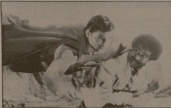
Christopher Reeve takes Richard Pryor for a ride in Superman III. The movie starts here this weekend.

Tuesday. A graduate student, played by Dustin Hoffman, inadvertently gets mixed up with some international spies. Lawrence Olivier plays the villain. A chilling, suspenseful story that ranks among the best of the genre. Rated PG.