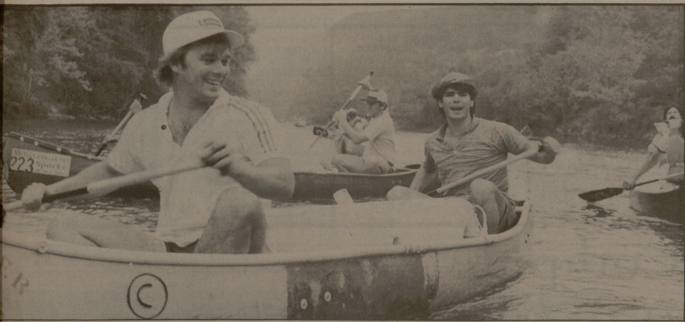
Up a creek