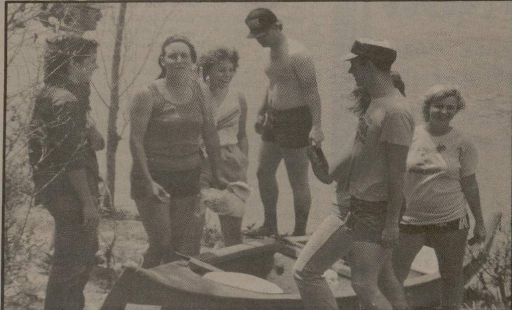
"Now that the race is over, who's going to carry this up that hill?"