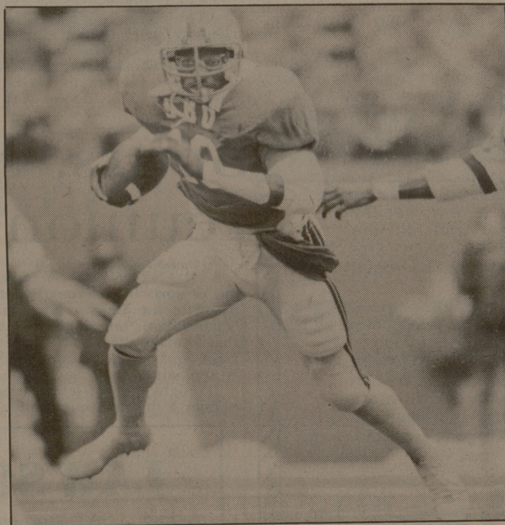
SMU tailback Eric Dickerson picked No. 2 by Rams