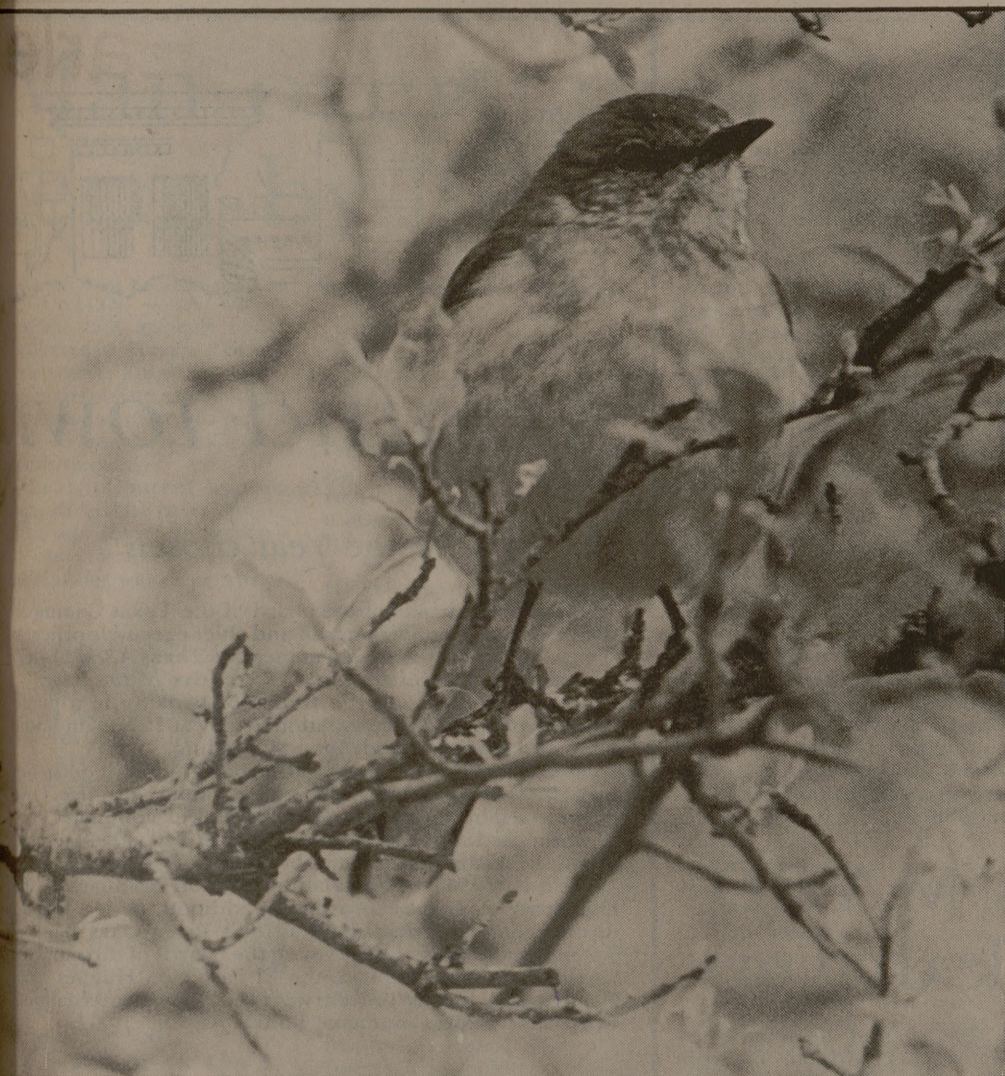
Signs of spring?