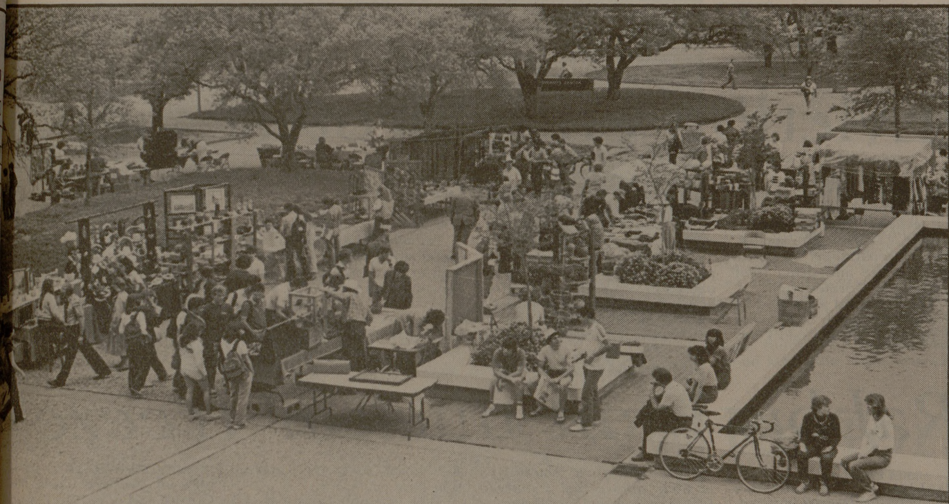
Aggie Craft Festival