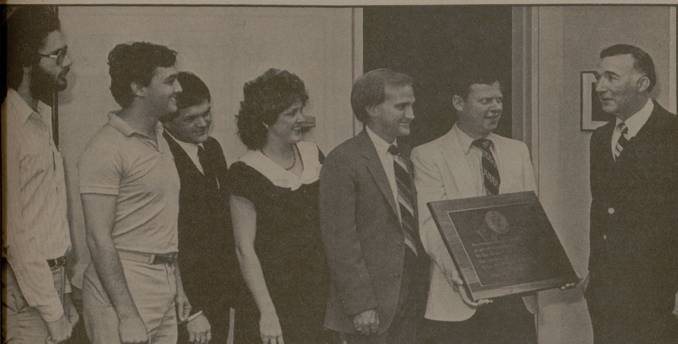
25 years of service

Students who plan to Pre-Register for the Fall Semester in the General Studies Program are URGED to pick up a Pre-registration Form in Room 100 of Harrington Tower from Mar. 28 thru Apr. 15.