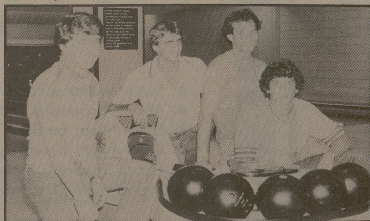
GARUDA won the All-University Men's A Team Bowling Championship.