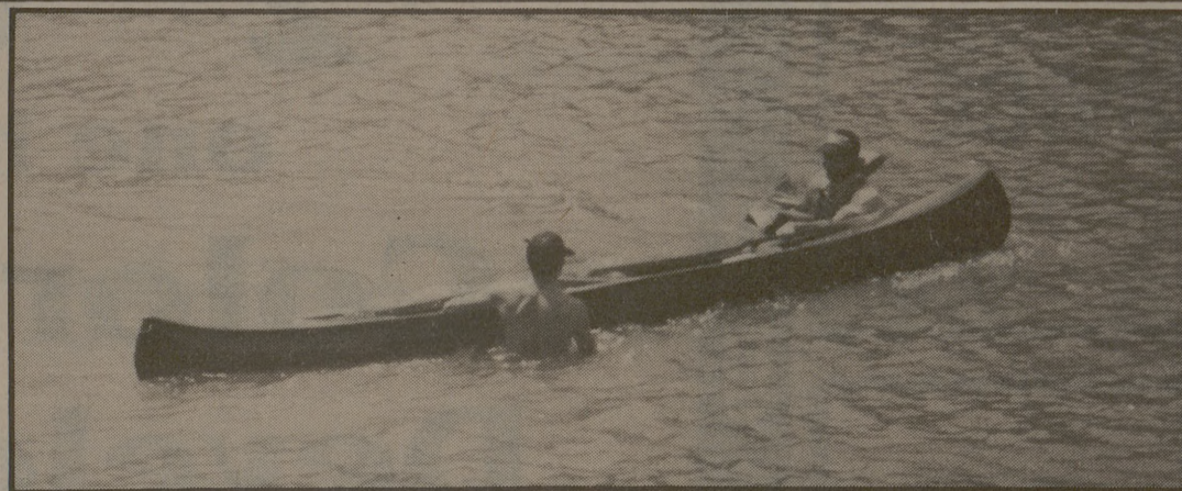
This is now the way to win the IM Canoe Race but it is a great way to cool off!!

PENBERTHY TOURNAMENT: A limited number of softball entries will be accepted in the IM-REC Sports Office, 159 East Kyle. So if you missed the deadline for entering your team, you have another chance! Remember to bring your $40.00 team entry fee with you. For more information contact the IM-REC Sports Office at 845-7826.