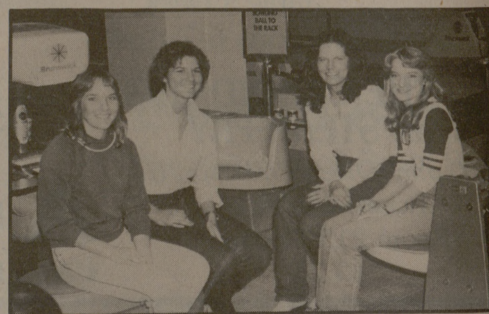
Congratulations Haas Honeys for winning the All-University Class A Bowling Championship.

McDonald's® Intramural Highlights is sponsored each Monday in the Battalion by your local McDonald's® Restaurants at University Drive, Manor East Mall and on Texas Avenue. Stories are provided by members of the Intramural-Recreational Staff. Photos are by Debbie Drielle and Tom Davies.