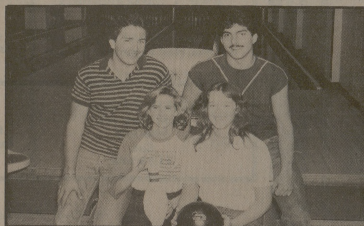
Outta The Streets & Into The Alley took the All-University CoRec A Team Bowling title.