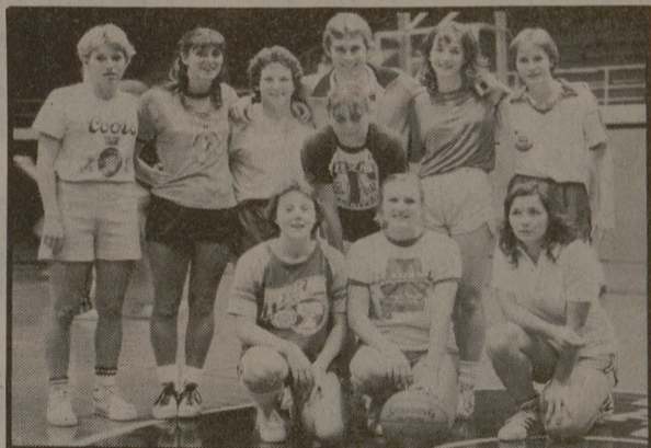
The 2%ERS take home the Women's Class A Basketball title and T-shirts!

ARCHERY SINGLES & DOUBLES: Hey, TAMU archers! Entries are now being accepted for Intramural Archery in the IM-REC Sports Office in 159 East Kyle. Divisions offered are: Singles - Men's and Women's; Doubles - Men's, Women's, and CoRec. Individuals may enter as many as three divisions. Participants must provide their own equipment.