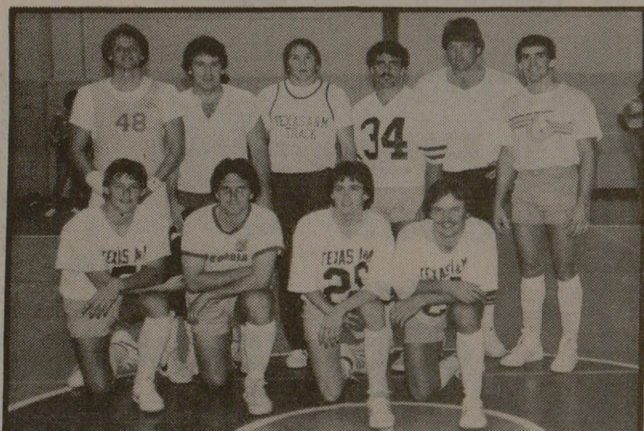
The Clydesdales claim the All-University Men's Class B Basketball Championship!