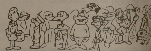
Day students get their news from the Battalion.