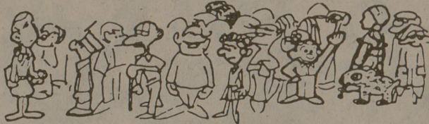
Day students get their news from the Batt.

Nebraska, which never has qualified for the NCAA, is making its fourth appearance in the NIT. This is the first time the team has advanced as far as the third round.