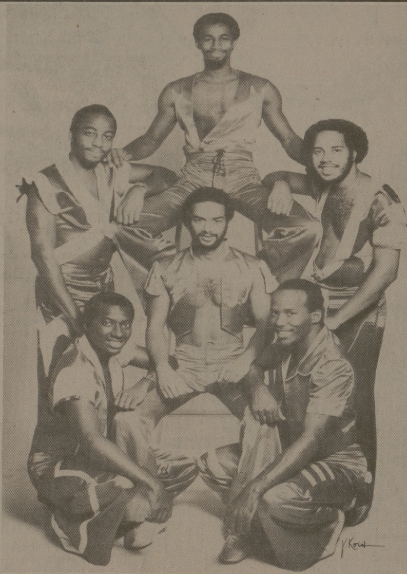
THE ULTIMATE FORCE