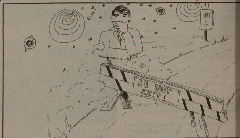
STRANGE: This mysterious roadblock has locked Brazos County residents into their own version of the Twilight Zone!

Several students said the roadblock was "bad bull."