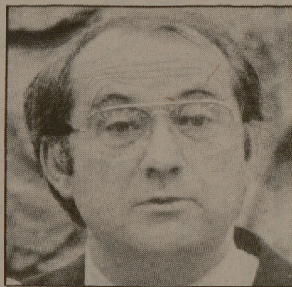
Rep. Phil Gramm