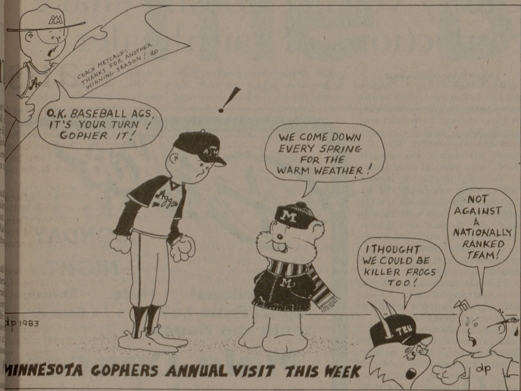
MINNESOTA GOPHERS ANNUAL VISIT THIS WEEK