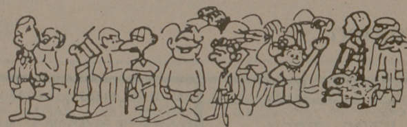
Day students get their news from the Batt.