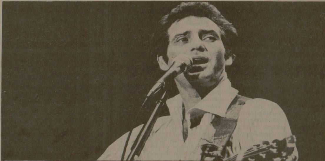
Larry Gatlin sings Thursday night in G. Rollie White coliseum.