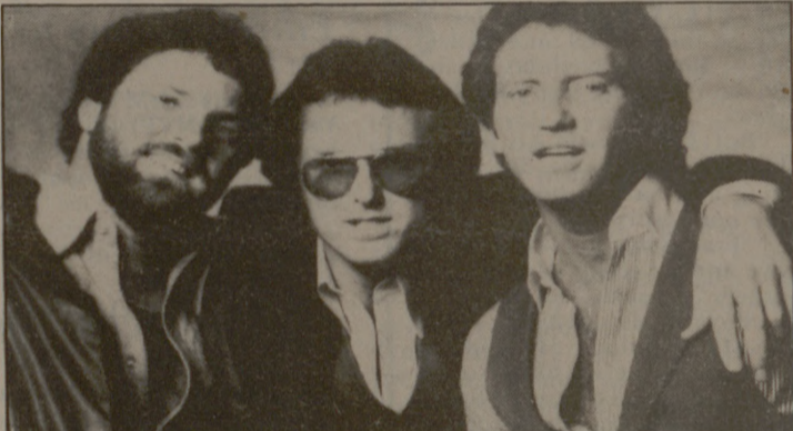
Larry Gatlin and the Gatlin Brothers Band will be performing in G. Rollie White Coliseum tonight at 8 p.m.

Battalion Staff Even if MSC Town Hall didn't give Larry Gatlin and the Gatlin Brothers Band all the gold in California, they are playing in G. Rollie White Coliseum tonight. Larry, Steve and Rudy Gatlin, natives of Odessa, have been performing and recording together since they were teenagers. The brothers delivered their first album for Sword & Shield Records, a gospel label based in Arlington, while still in their teens. The oldest Gatlin, Larry, is the lead singer for the group. He got his start in the business while on tour with a gospel group, the Imperials, in Las Vegas. On the tour, he met singer Dottie West. When he returned to Houston, he sent West a tape of eight of his original songs. She recorded several of them and since then his career has taken off. On the strength of his song writing talents, Larry became known throughout Nashville's music industry and began to play in small clubs. He also was recording with his brothers back home, and in 1972 they released the single "New York City," but the song remained virtually unknown.