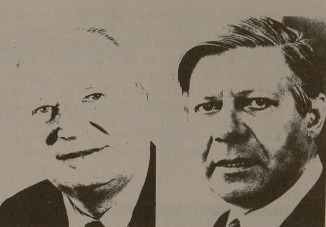
EDWARD HEATH Prime Minister of Great Britain 1970-74